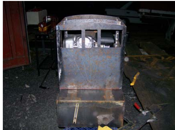
PART OF THE FRAME BEING WELDED, AND SIZING UP THE MOTOR 04-08-07.