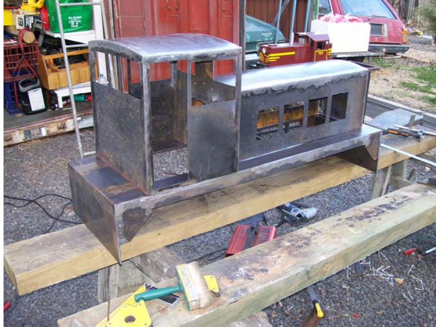
ENGINE BAY AND CAB ARE NOW JOINED