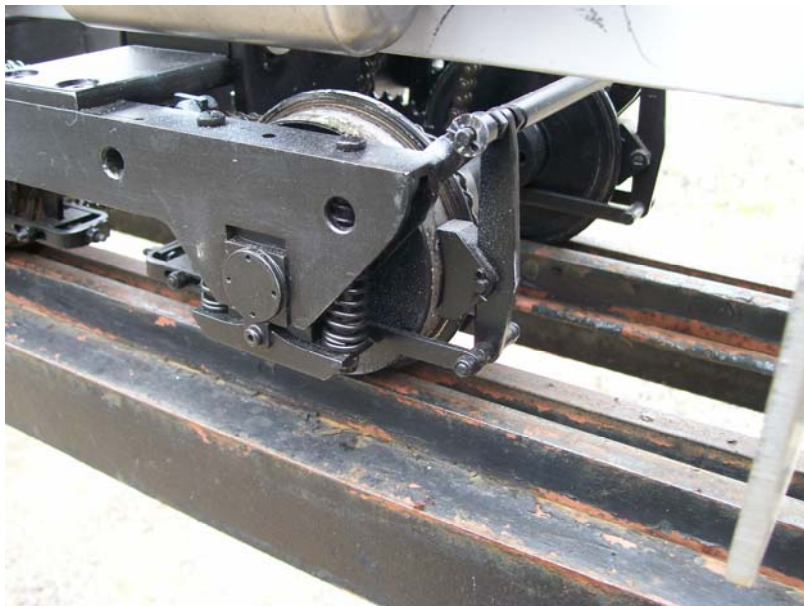
THE DETAIL IN THE BOGIE IS VERY CLEAR SHOWING THE BRAKES.