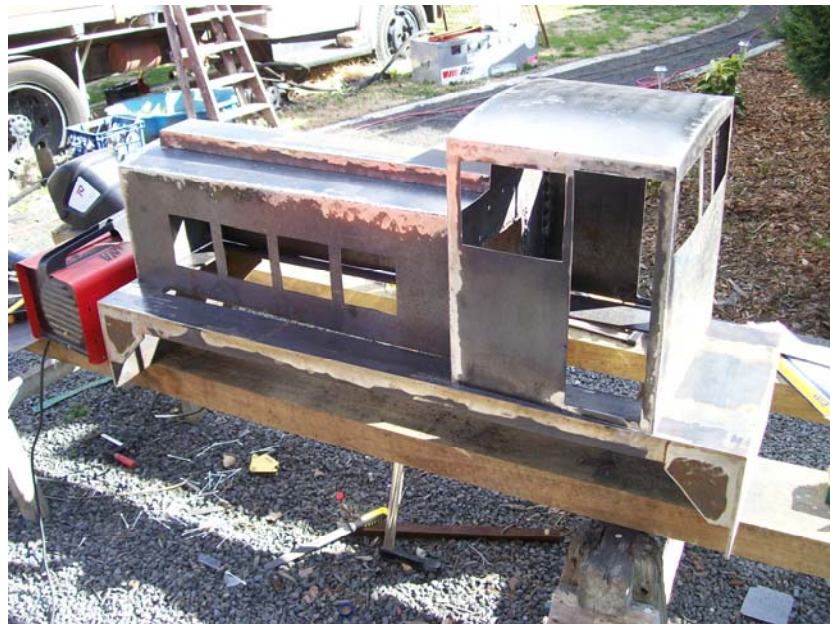
COOLUM TAKES SHAPE.