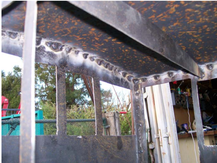
A START ON THE INSIDE OF COOLUM'S CAB